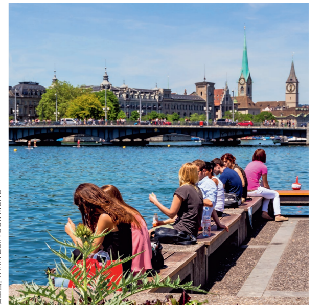
右上图: WIKIMEDIA COMMONS