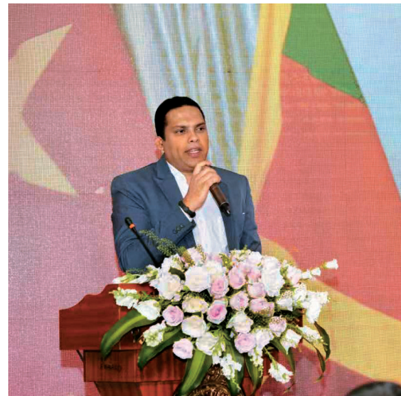
△ 斯里兰卡旅游和土地部部长 Harin Fernando